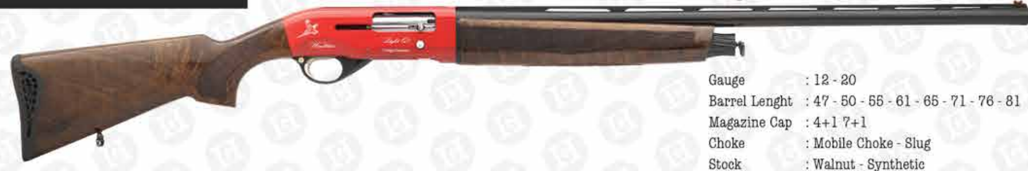
Target & Walther M13 RED

Gauge : 12 - 20 Barrel Length : 47 - 50 - 55 - 61 - 65 - 71 - 76 - 81 Magazine Cap : 4+1 7+1 Choke : Mobile Choke - Slug Stock : Walnut - Synthetic