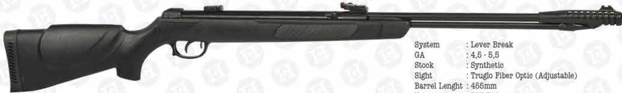
QUEEN AI-255S, LEVER BREAK, SYNTHETIC

System : Lever Break GA : 4,5 - 5,5 Stock : Synthetic Sight : Truglo Fiber Optic (Adjustable) Barrel Length : 455mm Velocity : 175-340 m/s