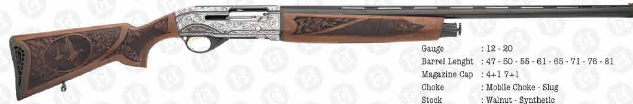
Target & Walther M13 Figure

Gauge : 12 - 20 Barrel Length : 47 - 50 - 55 - 61 - 65 - 71 - 76 - 81 Magazine Cap : 4+1 7+1 Choke : Mobile Choke - Slug Stock : Walnut - Synthetic