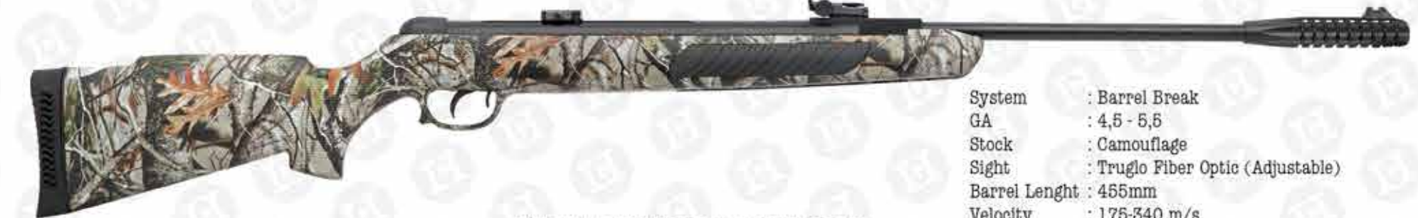
QUEEN NEXT VISTA

System : Barrel Break GA : 4,5 - 5,5 Stock : Camouflage Sight : Truglo Fiber Optic (Adjustable) Barrel Length : 455mm Velocity : 175-340 m/s