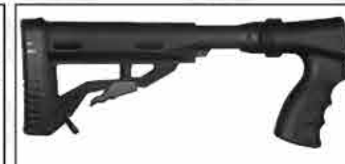
Foldable right and left telescopic stock with shock absorber