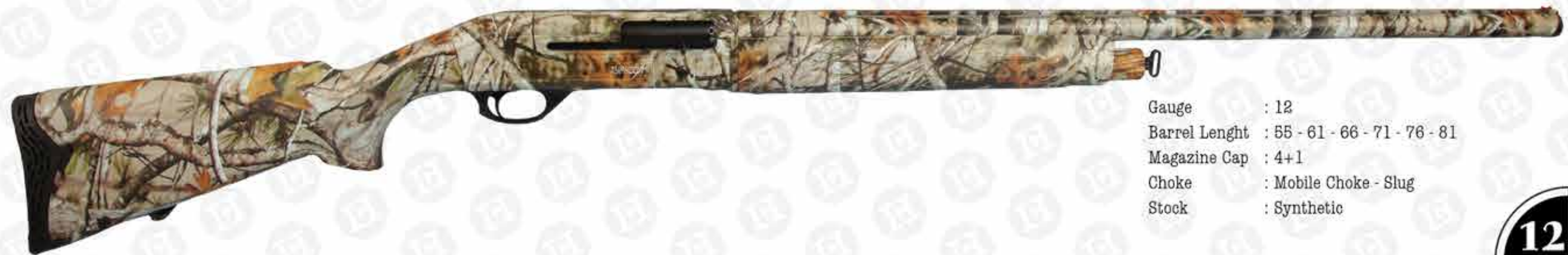
Target & Walther TYPHOON 0G42

Gauge : 12 Barrel Length : 55 - 61 - 66 - 71 - 76 - 81 Magazine Cap : 4+1 Choke : Mobile Choke - Slug Stock : Synthetic