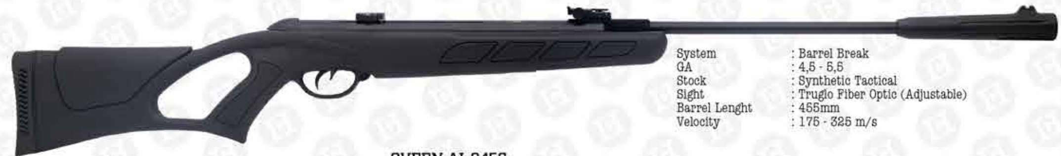
QUEEN AI-755S, SILENCER

System : Barrel Break GA : 4,5 - 5,5 Stock : Synthetic Tactical Sight : Truglo Fiber Optic (Adjustable) Barrel Length : 455mm Velocity : 175 - 325 m/s