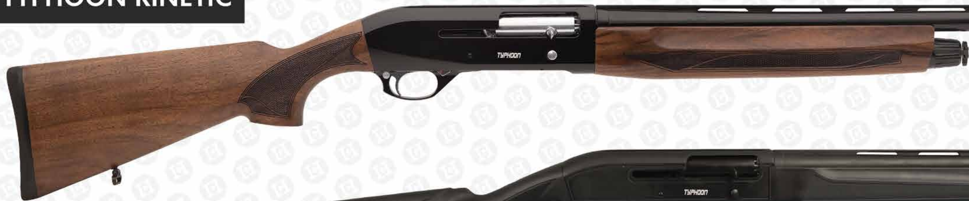
Target & Walther TYPHOON

Gauge : 12 Barrel Length : 55 - 61 - 66 - 71 - 76 - 81 Magazine Cap : 4+1 Choke : Mobile Choke - Slug Stock : Walnut