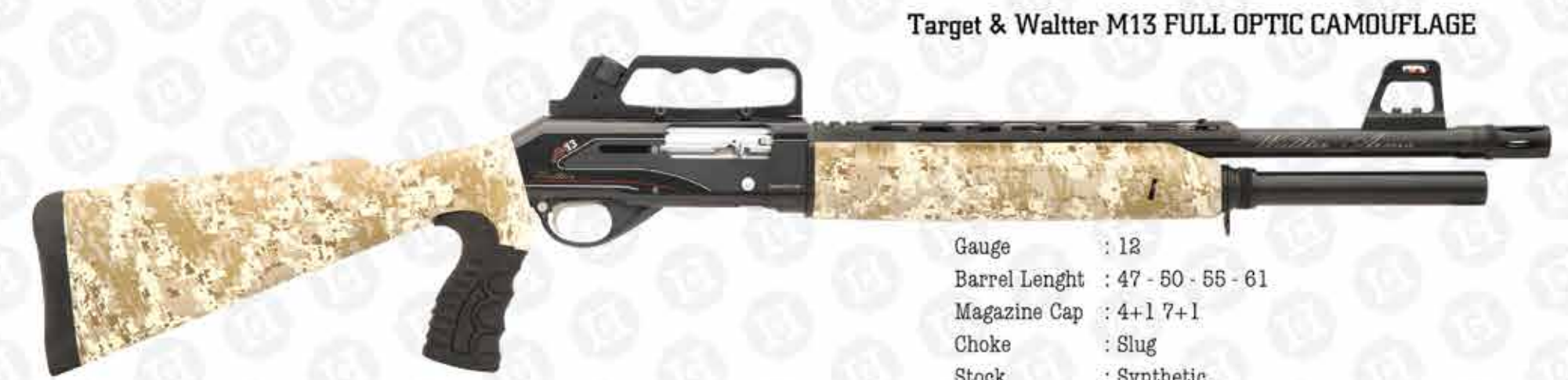
Target & Walther M13 FULL OPTIC CAMOUFLAGE

Gauge : 12 - 20 Barrel Length : 47 - 50 - 55 - 61 - 65 - 71 - 76 - 81 Magazine Cap : 4+1 7+1 Choke : Slug Stock : Synthetic