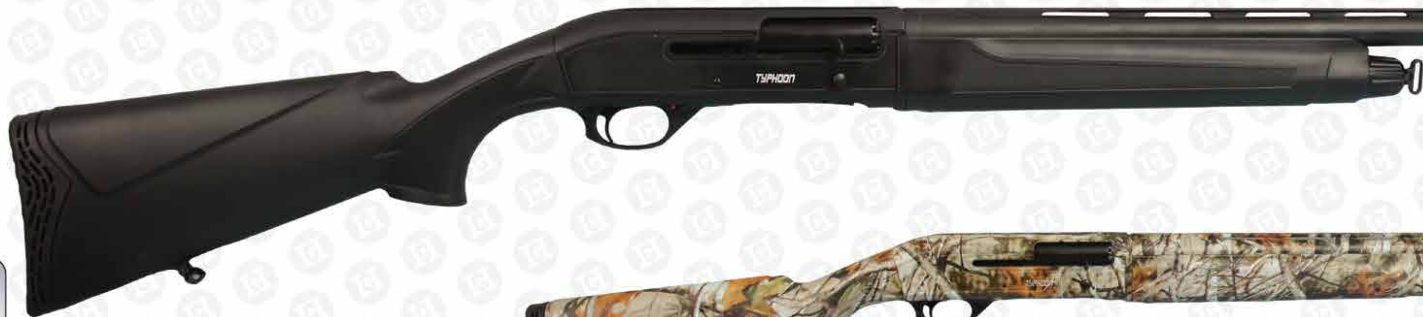
Target & Walther TYPHOON

Gauge : 12 Barrel Length : 55 - 61 - 66 - 71 - 76 - 81 Magazine Cap : 4+1 Choke : Mobile Choke - Slug Stock : Walnut