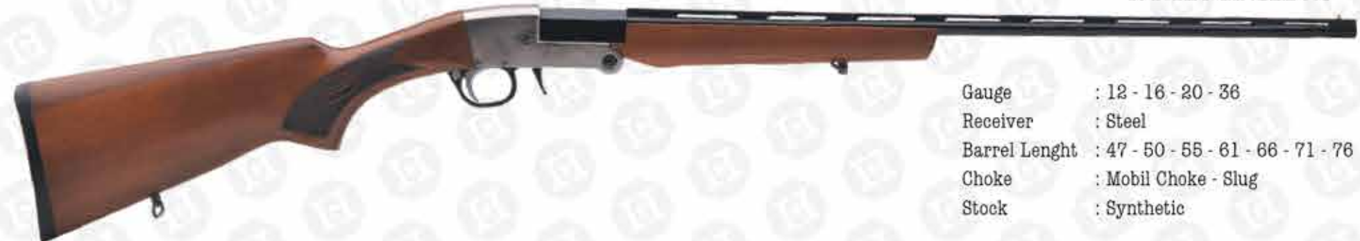
TARGET SINGLE HT

Gauge : 12 - 16 - 20 - 36 Receiver : Steel Barrel Length : 47 - 50 - 55 - 61 - 66 - 71 - 76 Choke : Mobil Choke - Slug Stock : Synthetic