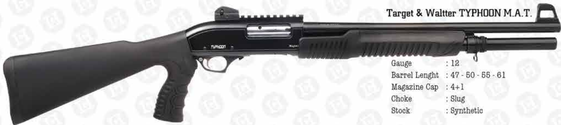
Target & Waltham TYPHOON M.A.T.

Gauge : 12 Barrel Length : 47 - 50 - 55 - 61 Magazine Cap : 4+1 Choke : Slug Stock : Synthetic