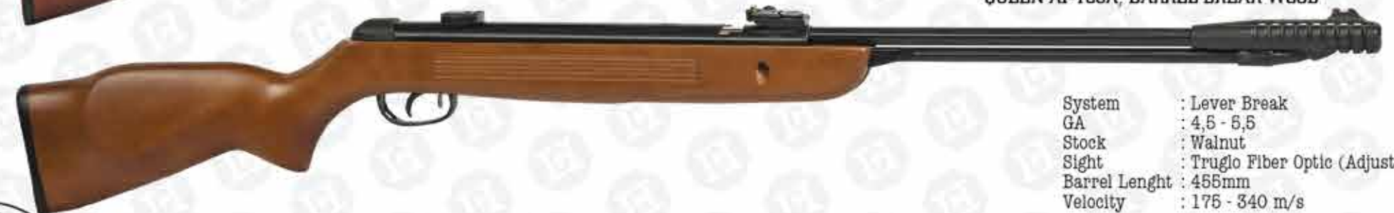
QUEEN AI-155A, BARREL BREAK WOOD

System : Lever Break GA : 4,5 - 5,5 Stock : Walnut Sight : Truglo Fiber Optic (Adjustable) Barrel Length : 455mm Velocity : 175 - 340 m/s