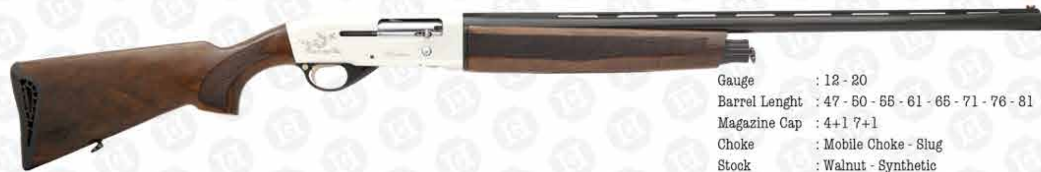
Target & Walther M13 WHITE

Gauge : 12 - 20 Barrel Length : 47 - 50 - 55 - 61 - 65 - 71 - 76 - 81 Magazine Cap : 4+1 7+1 Choke : Mobile Choke - Slug Stock : Walnut - Synthetic