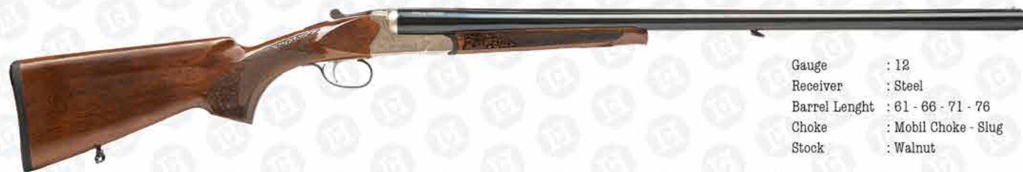
QUEEN S&S WHITE

Gauge : 12 System : Extractor OR Ejector Receiver : Steel Barrel Lenght : 61 - 66 - 71 - 76 Choke : Mobil Choke - Slug Stock : Walnut