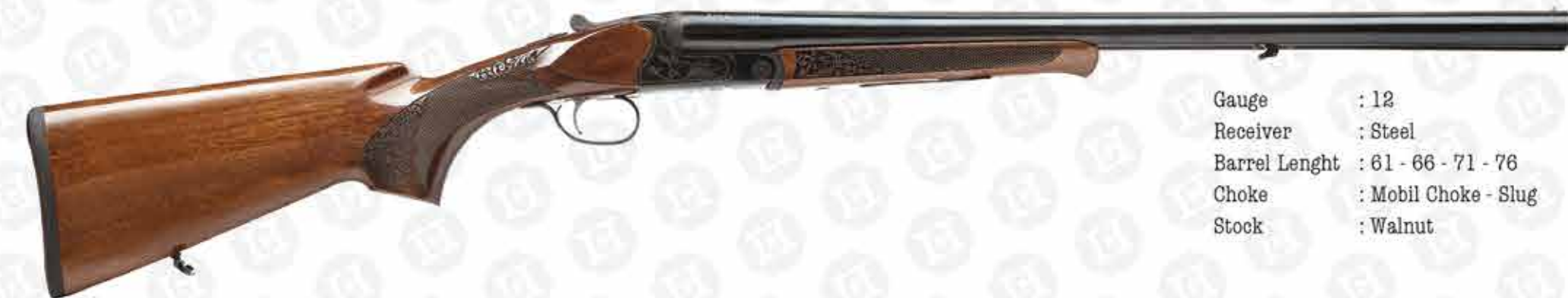
QUEEN S&S BLACK

Gauge : 12 Receiver : Steel Barrel Lenght : 61 - 66 - 71 - 76 Choke : Mobil Choke - Slug Stock : Walnut