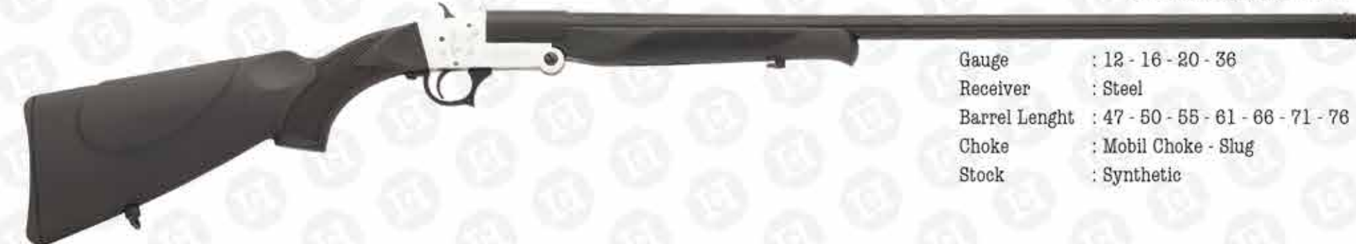
TARGET SINGLE ON2

Gauge : 12 - 16 - 20 - 36 Receiver : Steel Barrel Length : 47 - 50 - 55 - 61 - 66 - 71 - 76 Choke : Mobil Choke - Slug Stock : Synthetic