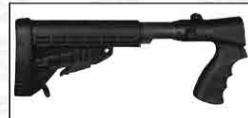
Foldable right & left stocks & Telescopic

Gauge : 12 Barrel Length : 47 - 50 - 55 - 61 Magazine Cap : 4+1 7+1 Choke : Slug Stock : Synthetic