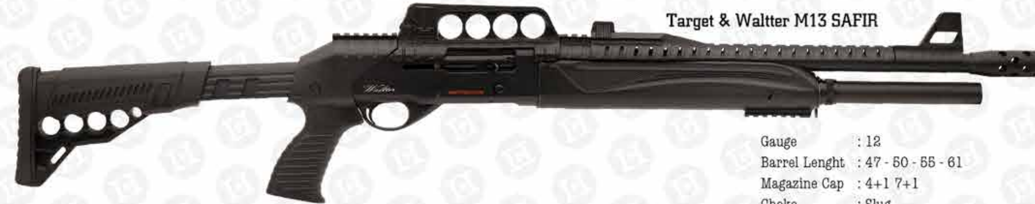
Target & Walther M13 SAFIR

Gauge : 12 Barrel Length : 47 - 50 - 55 - 61 Magazine Cap : 4+1 7+1 Choke : Slug Stock : Walnut - Synthetic