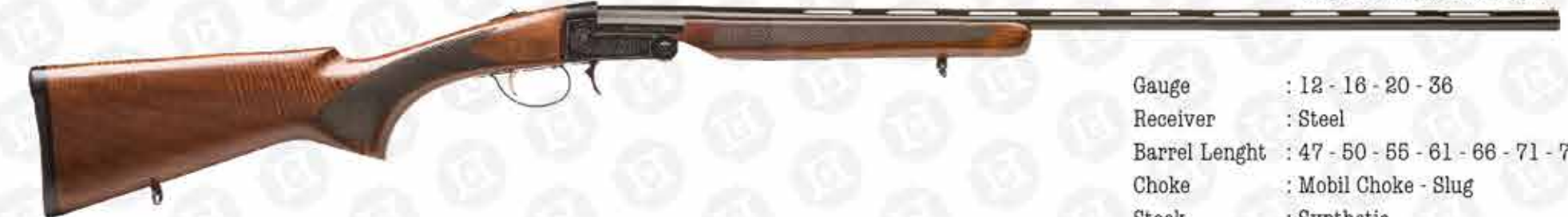
TARGET SINGLE GP9

Gauge : 12 - 16 - 20 - 36 Receiver : Steel Barrel Length : 47 - 50 - 55 - 61 - 66 - 71 - 76 Choke : Mobil Choke - Slug Stock : Synthetic