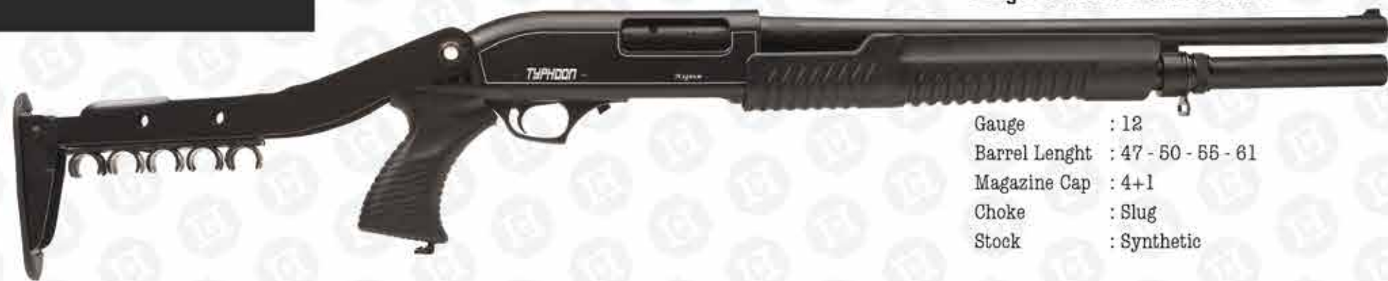
Target & Waltham TYPHOON G

Gauge : 12 Barrel Length : 47 - 50 - 55 - 61 Magazine Cap : 4+1 Choke : Slug Stock : Synthetic