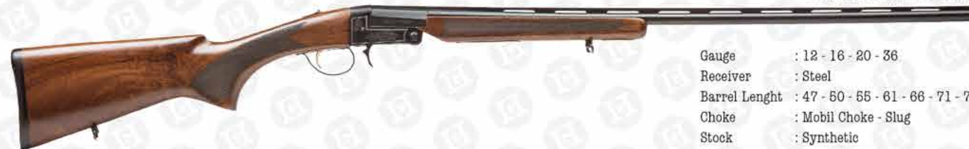
TARGET SINGLE GP36

Gauge : 12 - 16 - 20 - 36 Receiver : Steel Barrel Length : 47 - 50 - 55 - 61 - 66 - 71 - 76 Choke : Mobil Choke - Slug Stock : Synthetic