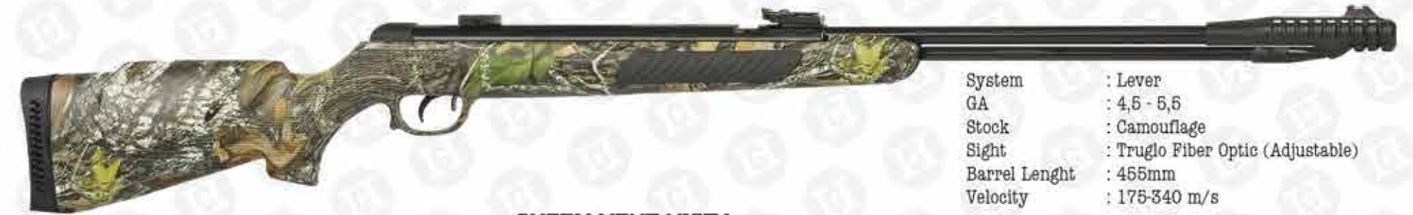
QUEEN OBSESION MOSSY OAK

System : Lever GA : 4,5 - 5,5 Stock : Camouflage Sight : Truglo Fiber Optic (Adjustable) Barrel Length : 455mm Velocity : 175-340 m/s