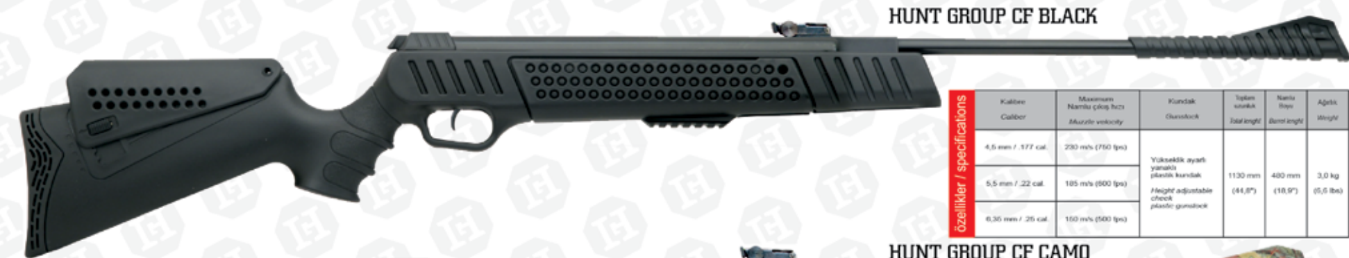
HUNT GROUP CF BLACK