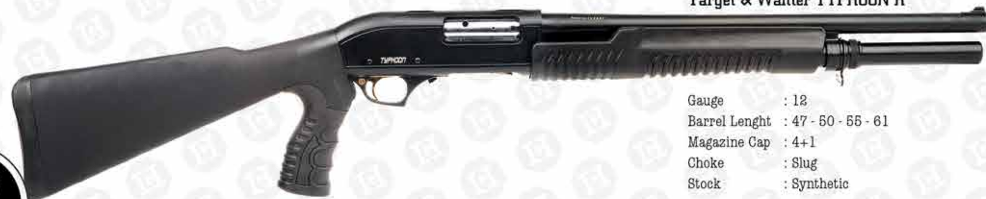
Target & Waltham TYPHOON K

Gauge : 12 Barrel Length : 47 - 50 - 55 - 61 Magazine Cap : 4+1 Choke : Slug Stock : Synthetic