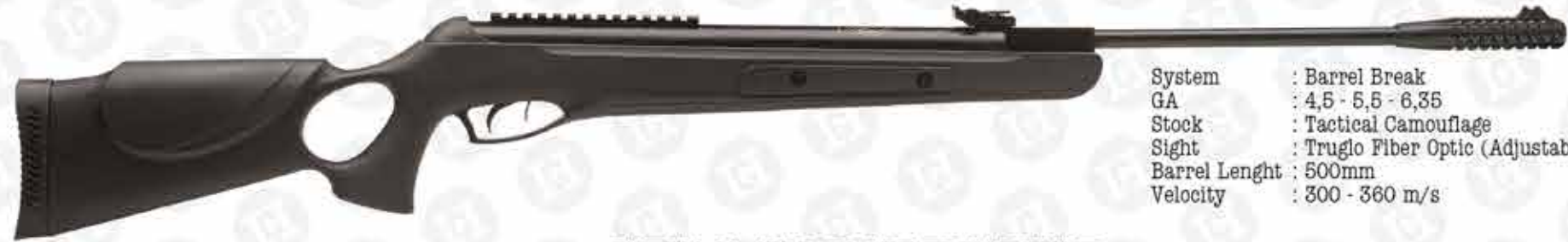
QUEEN AI-455S, UNIQUE FRONT SIGHT

System : Barrel Break GA : 4,5 - 5,5 - 6,35 Stock : Tactical Camouflage Sight : Truglo Fiber Optic (Adjustable) Barrel Length : 500mm Velocity : 300 - 360 m/s