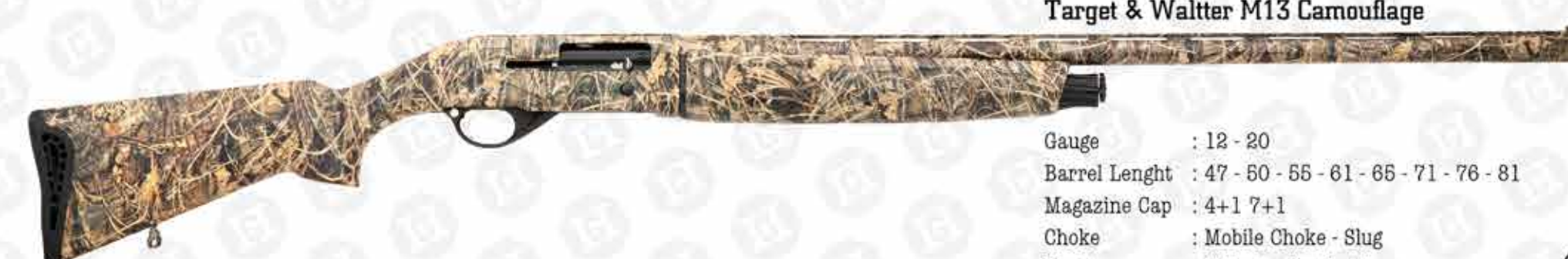
Target & Walther M13 Camouflage

Gauge : 12 - 20 Barrel Length : 47 - 50 - 55 - 61 - 65 - 71 - 76 - 81 Magazine Cap : 4+1 7+1 Choke : Mobile Choke - Slug Stock : Walnut - Synthetic