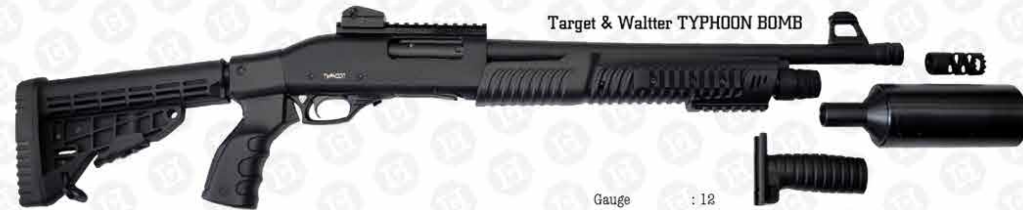
Target & Waltham TYPHOON BOMB

Gauge : 12 Barrel Length : 47 - 50 - 55 - 61 Magazine Cap : 4+1 Choke : Slug Stock : Synthetic