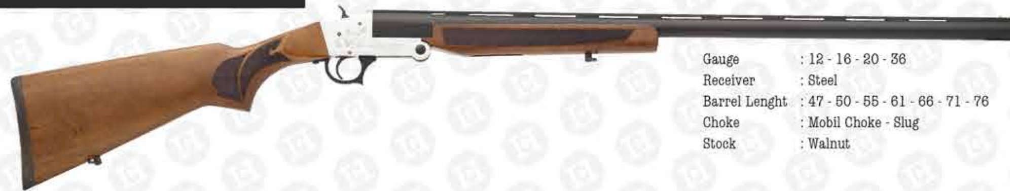
TARGET SINGLE ON1

Gauge : 12 - 16 - 20 - 36 Receiver : Steel Barrel Length : 47 - 50 - 55 - 61 - 66 - 71 - 76 Choke : Mobil Choke - Slug Stock : Walnut