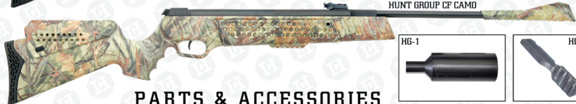
HUNT GROUP CF CAMO