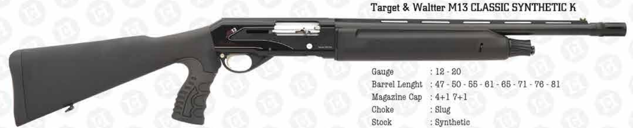
Target & Walther M13 CLASSIC SYNTHETIC K

Gauge : 12 Barrel Length : 47 - 50 - 55 - 61 Magazine Cap : 4+1 7+1 Choke : Slug Stock : Synthetic