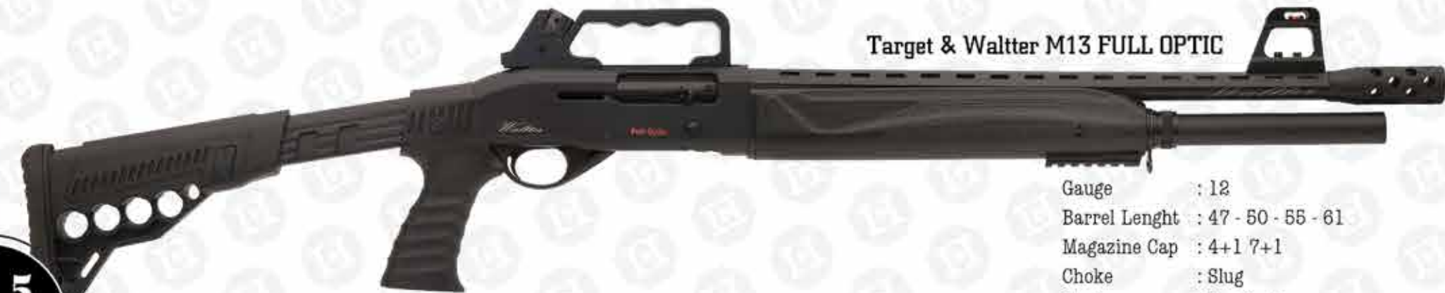
Target & Walther M13 FULL OPTIC

Gauge : 12 Barrel Length : 47 - 50 - 55 - 61 Magazine Cap : 4+1 7+1 Choke : Slug Stock : Synthetic