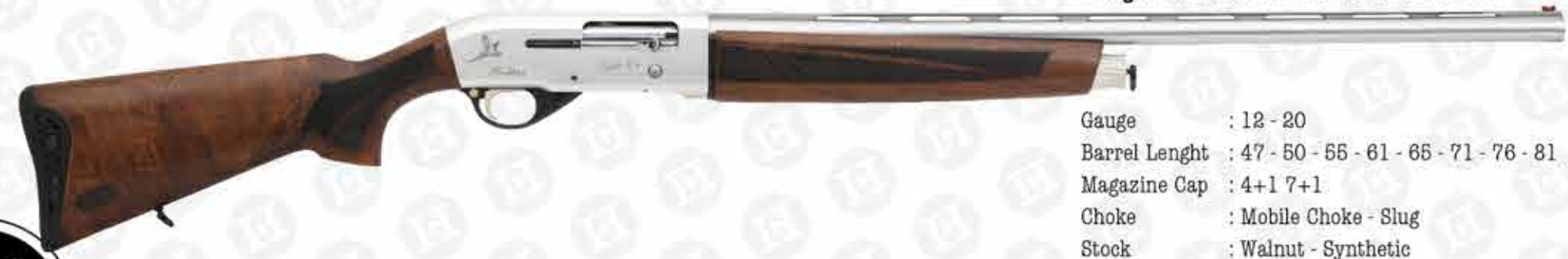
Target & Walther M13 FULL WHITE

Gauge : 12 - 20 Barrel Length : 47 - 50 - 55 - 61 - 65 - 71 - 76 - 81 Magazine Cap : 4+1 7+1 Choke : Mobile Choke - Slug Stock : Walnut - Synthetic