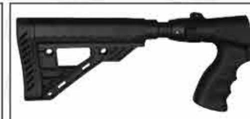
Foldable right & left standart with telescopic