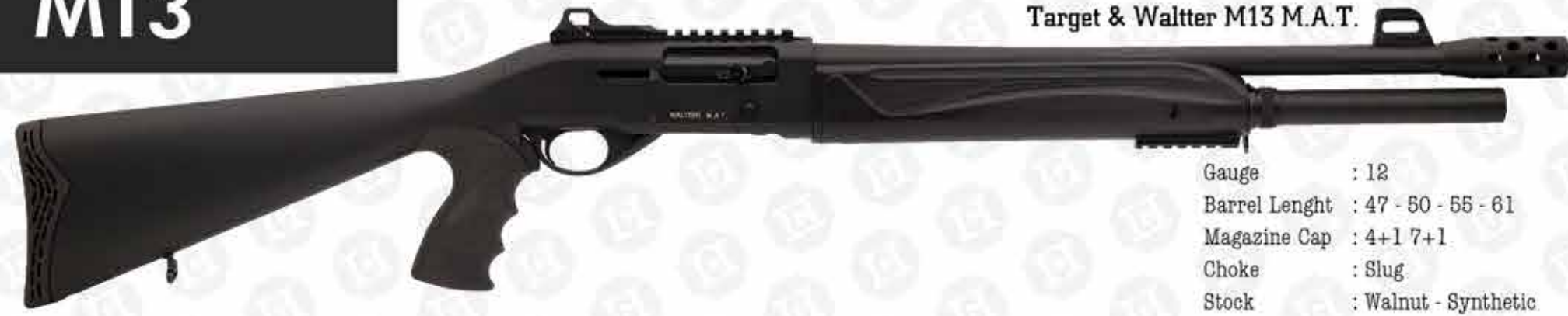
Target & Walther M13 M.A.T.

Gauge : 12 Barrel Length : 47 - 50 - 55 - 61 Magazine Cap : 4+1 7+1 Choke : Slug Stock : Walnut - Synthetic