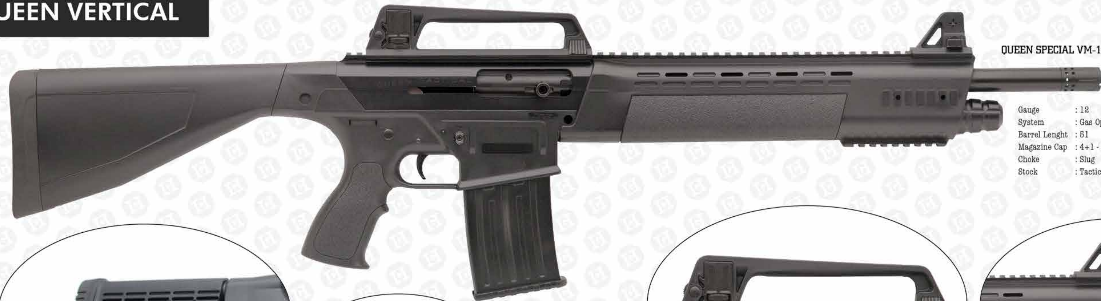
QUEEN SPECIAL VM-15

Gauge : 12 System : Gas Operated Barrel Length : 51 Magazine Cap : 4+1 - 9+1 Choke : Slug Stock : Tactical Synthetic