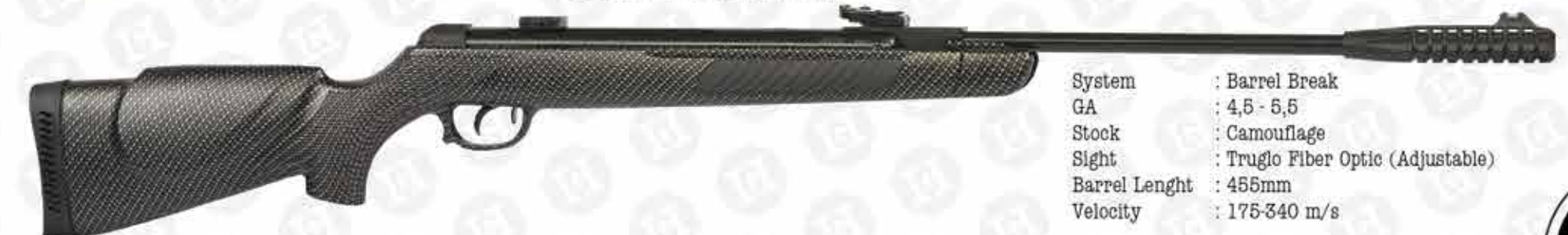
QUEEN CARBON FIBER

System : Barrel Break GA : 4,5 - 5,5 Stock : Camouflage Sight : Truglo Fiber Optic (Adjustable) Barrel Length : 455mm Velocity : 175-340 m/s