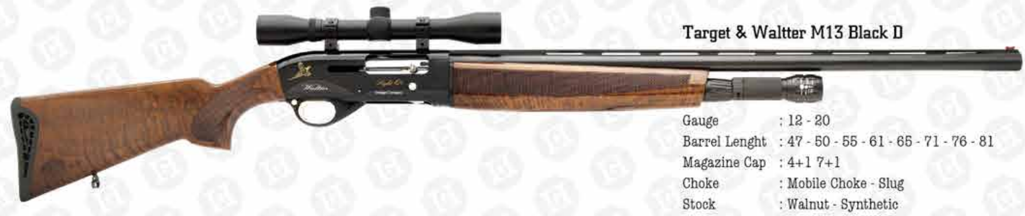
Target & Walther M13 Black D

Gauge : 12 - 20 Barrel Length : 47 - 50 - 55 - 61 - 65 - 71 - 76 - 81 Magazine Cap : 4+1 7+1 Choke : Mobile Choke - Slug Stock : Walnut - Synthetic