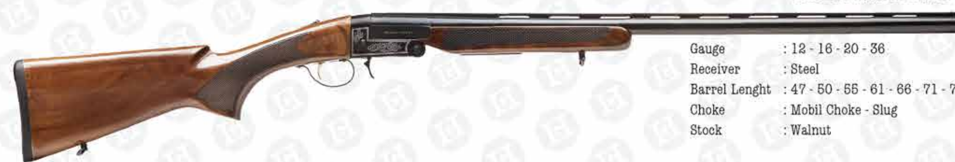
TARGET SINGLE GP12

Gauge : 12 - 16 - 20 - 36 Receiver : Steel Barrel Length : 47 - 50 - 55 - 61 - 66 - 71 - 76 Choke : Mobil Choke - Slug Stock : Walnut